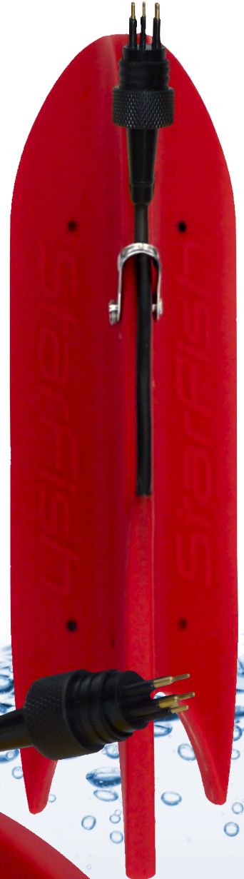
StarFish 990F Towed Sonar Head

Measuring less than 15 inches long the StarFish 990F sonar is small enough to be transported in your rucksack. Lightweight and quick to deploy by hand, the 990F towed system is independent of the boat requiring no fixed installation which makes it easy to transport and operate from any vessel. The StarFish Peli Case provides a rugged and watertight method for transporting and storing your StarFish system.