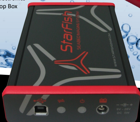
StarFish 990 Electronics Top Box